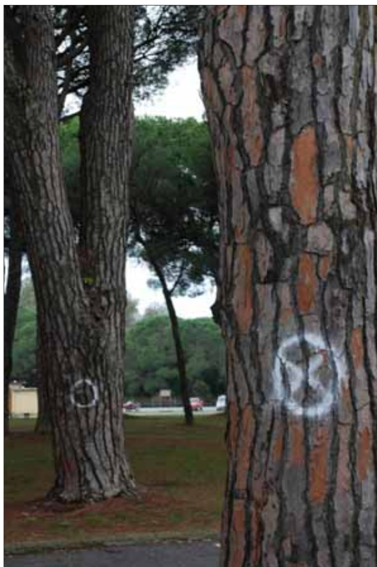
Pine trees on Camp Darby with a crossed circle were slated for the first removal beginning Nov. 6. Community members are advised to not seek shelter under these trees during storms as they may become unstable due to advanced age.

"This challenging project might seem a loss from a first look, but it is absolutely necessary to cut these old trees to allow the growth of new, young ones that will be with us for the years to come," added Col. Raffaele Iubini, Italian base commander.