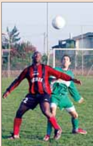
SETAF Lions tie with ASD Setteca